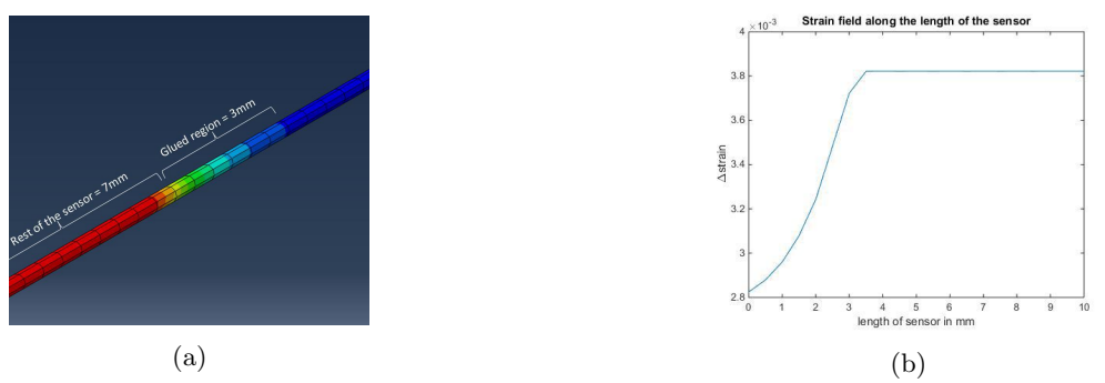
Figure 2: Finite element modelling of the optical fibre for the grating region (a) and the resulting strain distribution along its length (b) for the case of 3 mm adhesive coverage.